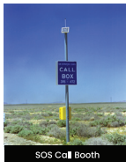
SOS Call Booth